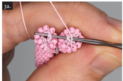
Join the tubes: poke the needle into the first of the three empty loops in the tube, where you left the thread. Then hook under one of the empty loops in the second tube (fig. no. 3a) and crochet them with a slip stitch. Proceed in the same way with the other two loops (fig. nos. 3b-3c).