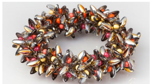
The bracelet will never retain its shape permanently, so you will have to straighten it. You can extend the bracelet, if you make more parts.