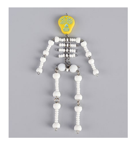
Step 8: Connect the top eye on the S to an earring hook.