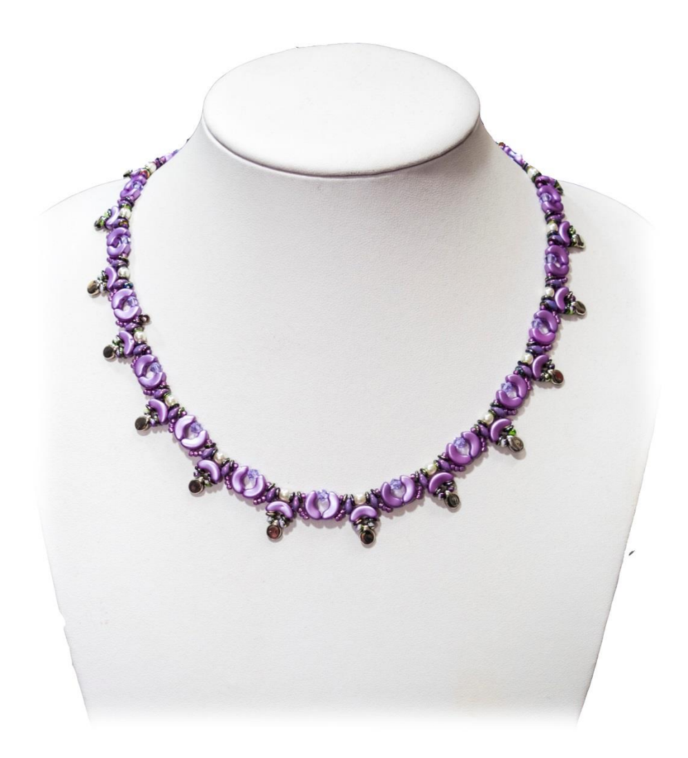
Enjoy your Beading!

For more Jewelry Patterns & Kits, beading supply please visit my shops: