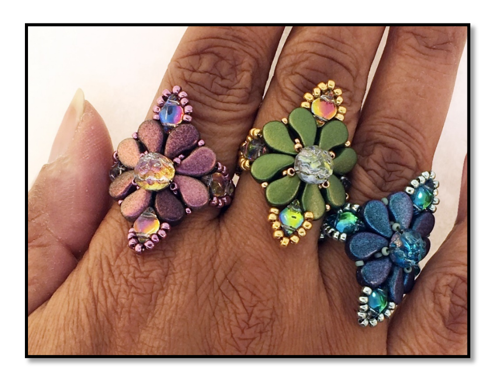
Give your hand some sparkle with this fun-to-make ring!