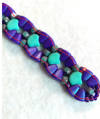
20) Weave whole bracelet around. Finish with a knot and stitch.