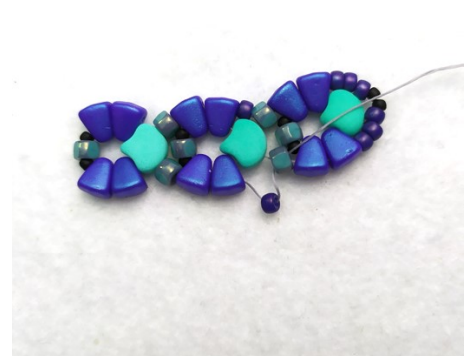
15) Add M8/0 and go through the next 3CUT.