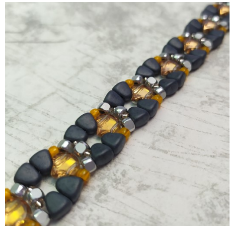
Nib-Bit: 23980/84400 Ginko: 00030/27102 3CUT 6/0: 00030/27000 Matubo 8/0: 81250 Toho 11/0: TR-11-31