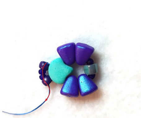
5) Go through 1x M8/0, 2x T11/0 and 1x M8/0.