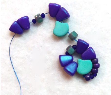
7) Add 1x 3CUT, 1x Ginko (from outside), 2x NB (narrow end), 1x T11/0, 1x 3CUT, 1x T11/0 and 2x NB (narrow end).