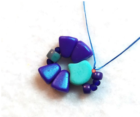
4) Tie the beads together and tighten them to form the base of the component.