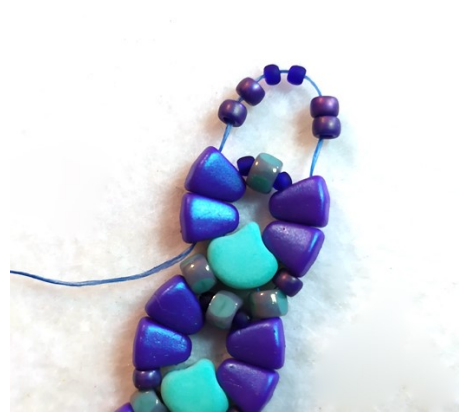
18) End of bracelet: string 2x M8/0, 2x T11/0 and 2x M8/0 and go through the next 2x NB (wide end).