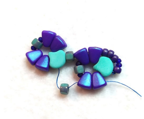
9) Add 1x 3CUT and go through 2x NB (wide end).