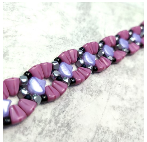
Nib-Bit: 74020 Ginko: 21310 3CUT 6/0: 00030/27000 Matubo 8/0: 23980/14400 Toho 11/0: TR-11-49F