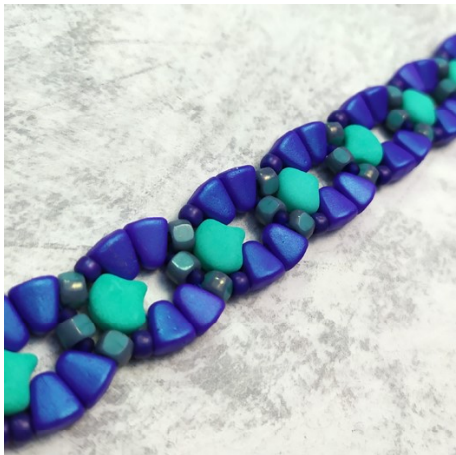
Nib-Bit: 02010/24510 Ginko: 02010/92928 3CUT 6/0: 63130/14495 Matubo 8/0: 33050/85001 Toho 11/0: TR-11-49F