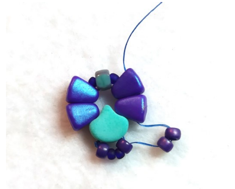
6) Add 2x M8/0 and pass through 2x NB (from wide end).