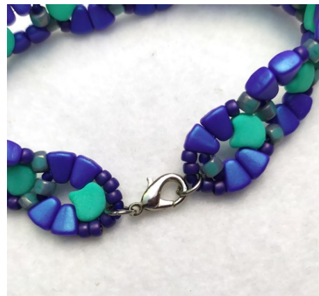
21) Add the clasp.