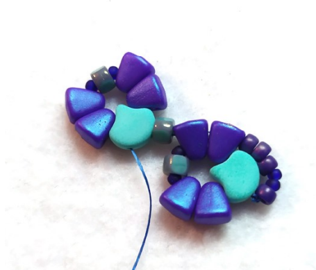
8) Go through the free hole of Ginko (from inside).