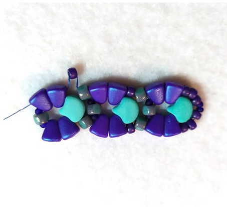
17) Add 1x M8/0 and pass through the next two NB (wide end). Now repeat steps 12) - 17).