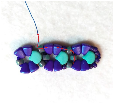
16) Pass through the beads as shown.