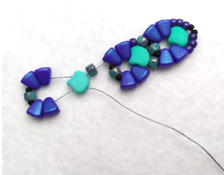
13) Repeat step 8).