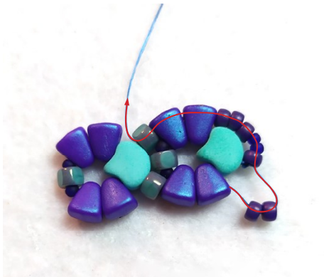
10) Add 2x M8/0 and pass through the beads, as shown.