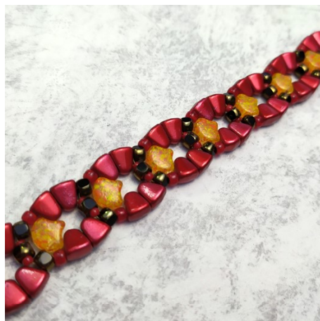
Nib-Bit: 23980/24209 Ginko: 00030/24402 3CUT 6/0: 23980/90215 Matubo 8/0: 91250 Toho 11/0: TR-11-45