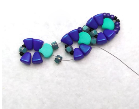
14) Repeat step 9).