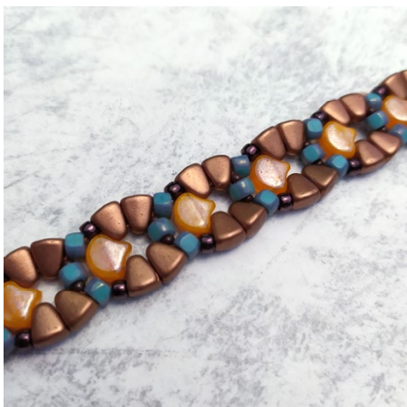
Nib-Bit: 00030/01780 Ginko: 81250 3CUT 6/0: 63130/14495 Matubo 8/0: 23980/15726 Toho 11/0: TR-11-46