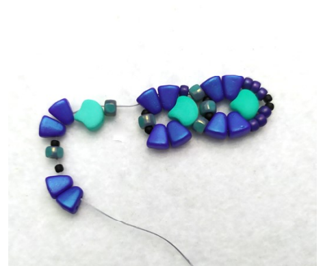
12) Repeat step 7).