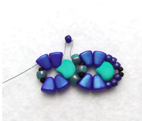
11) Add 1x M8/0 and go through 2x NB (wide end).