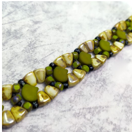
Nib-Bit: 03000/43500 Ginko: 02010/29535 3CUT 6/0: 53410/43500 Matubo 8/0: 23980/14400 Toho 11/0: TR-11-49F