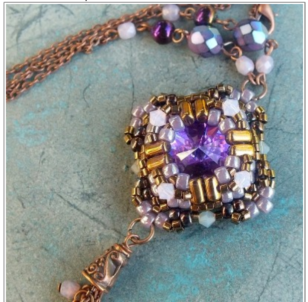
4mm Swarovski Bicones used instead of 4mm rounds