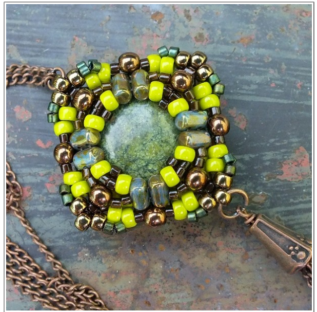
Flat round serpentinite bead used instead of a rivoli