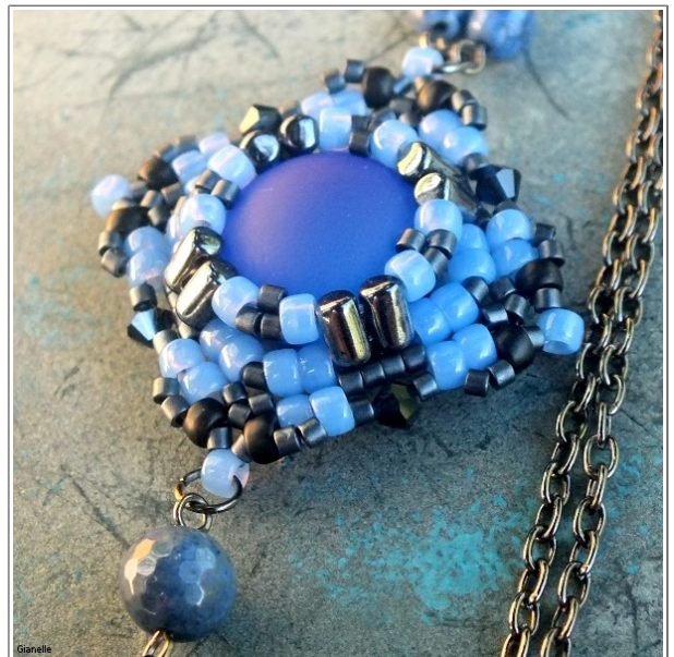
Glass cabochon used instead of a rivoli. I also skipped steps 15 and 16 and in step 32 I added one Delica, one 7/0 and one Delica (instead of just one 7/0)