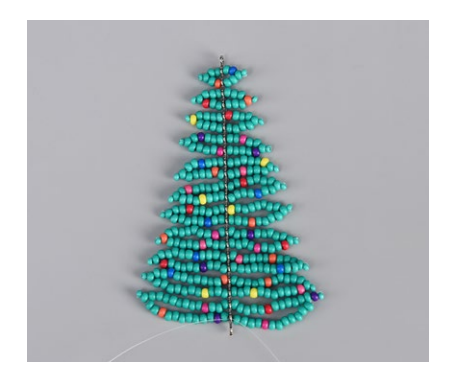
Step 5: If the longest projections are soft, you can thread the line through them one more time. The length of the line should enable this. The line will change sides (from the left to the right and vice versa). At the end, tie off the line with three knots. Pull the end into the R8 and cut it off.