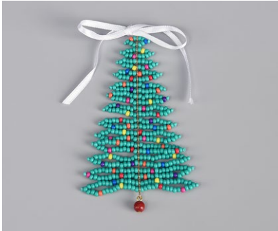
You can make Christmas trees in various color shades and different sizes or use them to brighten up your holiday outfit.