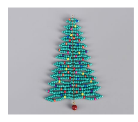
Step 7: Tie the cord, a ribbon or an earring hook to the top hole on the guide.