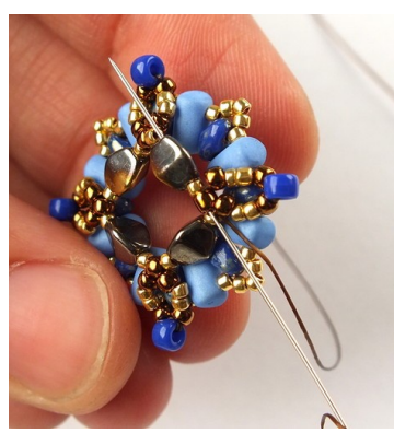
25) After you are done with reinforcing the last row, the thread should exit from one of the pinch beads.

24) ... like this. Now weave through the last row few more times. It is very important to do this, because otherwise the last row would not hold it's shape.