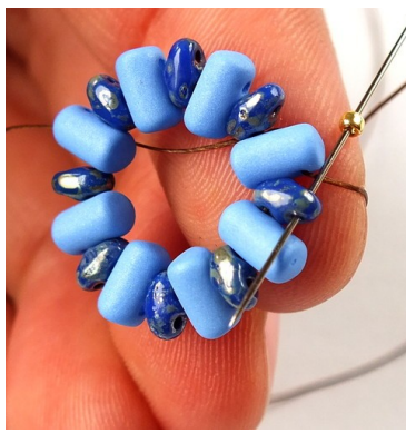
3) Add one 15/0 and pass through the upper hole of the next Miniduo.

7) Now the thread exits – again – into the gap above the Miniduo. Add one 11/0, one 8/0 and one 11/0 and pass through the next 15/0, Rulla and 15/0.