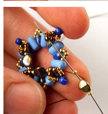
23) ... until you reach the end of the row ...

27) Repeat step 26, until you reach the end of the row. Then weave through the last row few more times and then tie off the thread and cut off all the tails.