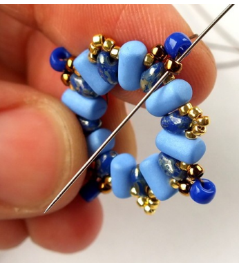
12) Skip the 8/0 and go down through the second 11/0 in the same corner.