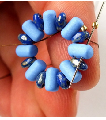
Add one 15/0 and pass through the upper hole of the next Rulla.