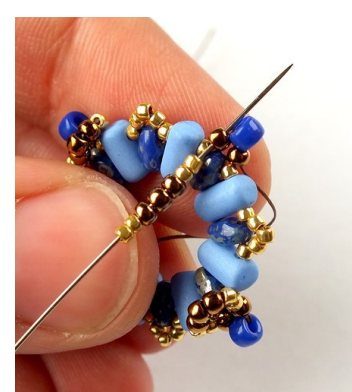
19) Repeat steps 11 – 15, until there is a loop in each of the four corners.