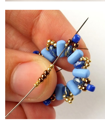
13) Add two 15/0s, three 11/0s and two 15/0s and then go up again through the first 11/0 from the same corner.