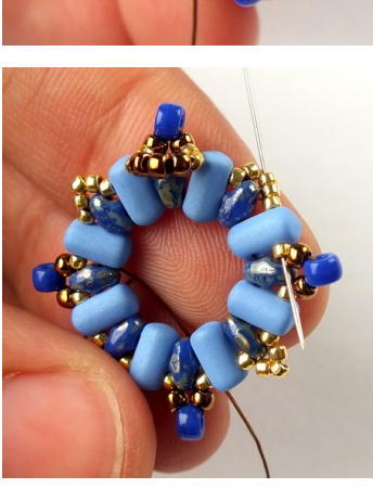
15) Weave through beads to get to the next corner ...