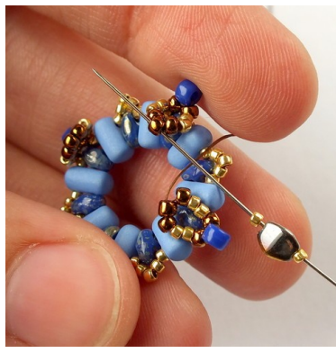
21) Add one 15/0, one pinch bead and one 15/0 and pass through the middle 11/0 from the next loop.