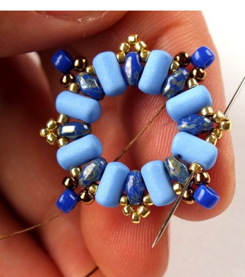
10) Weave through beads to get to the next corner – between the 15/0 and the 11/0.