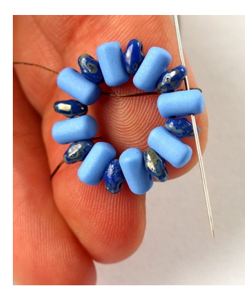
Slide all the beads to the end of the thread. Tie a square knot to form a circle. The pass through the upper hole of the nearest Rulla.

Add three 15/0s and pass through the next 15/0, Rulla and 15/0.