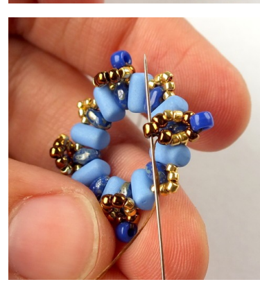
20) After you make the last loop, weave through beads to get to the "middle" 11/0 of this loop.