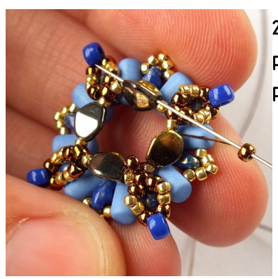
26) Add one 11/0 and pass through the next pinch bead.