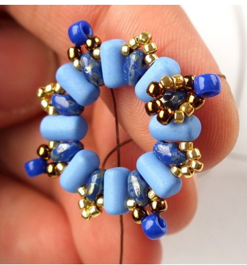
14) Pull snug. Now you have created a loop.