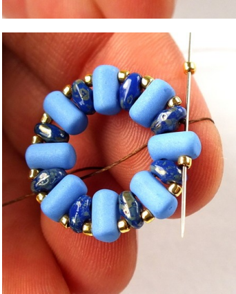
5) Repeat steps 3 and 4, until you reach the end of the row. Make the step-up by passing through the first 15/0 you added in this row.