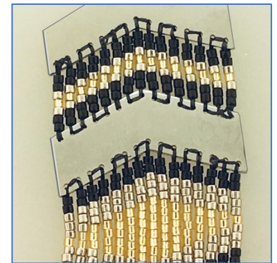
Thread bridges on underside